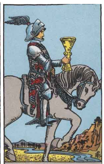
KNIGHT of CUPS.