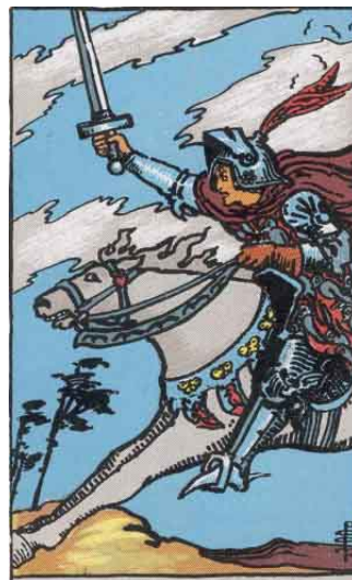
KNIGHT of SWORDS.