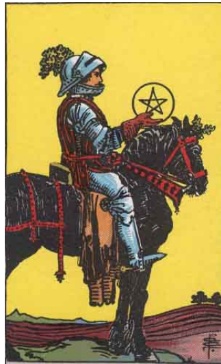
KNIGHT of PENTACLES.