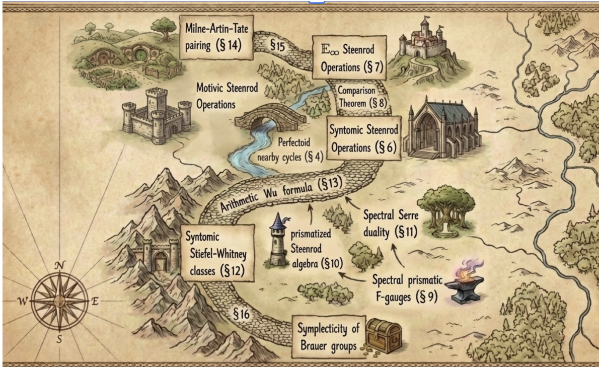
FIGURE 1. This roadmap depicts the long, winding journey to the symplectic arithmetic duality on higher Brauer groups.

Finally, Part 5 contains the applications to the main theorems on (higher) Brauer groups, including Theorem 1.1.3, Theorem 1.1.5, and their higher dimensional generalizations.