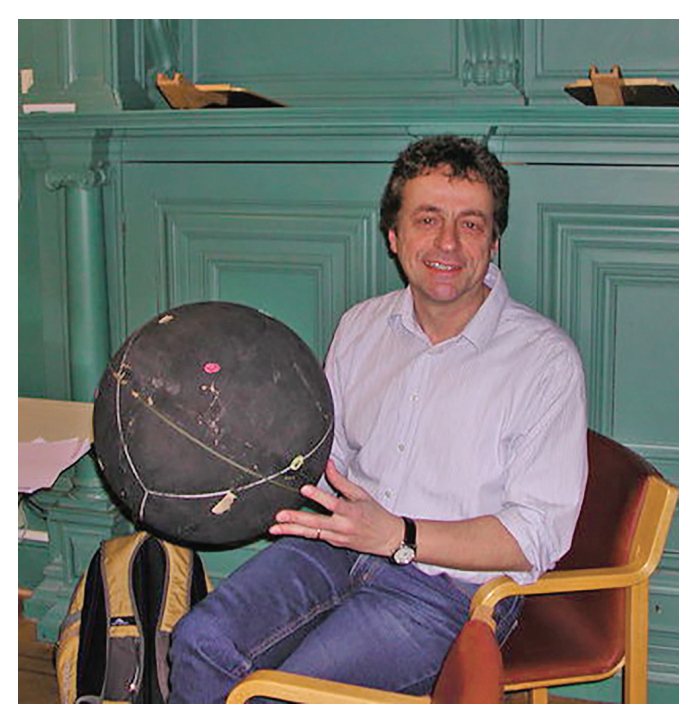
Bernd Sturmfels enjoying a spherical blackboard at the Institute Mittag-Leffler in Djursholm, Sweden.

matrix T = (t_{ij}) of format n_1 \times n_2 . The singular values \sigma of T satisfy