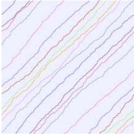
Figure 2: Cycles in a sample when n = m = 1000 .