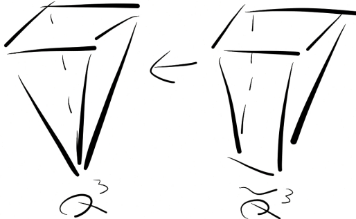
Figure 2: A toric picture.

Example Let Q^3 be the (complex) 3-dimensional quadric in 2 \times 2 complex matrices such that \det A = 0 . There is a toric picture of Q as a cone over a square (which is a toric picture of \mathbb{P}^1 \times \mathbb{P}^1 ). There is a small resolution \tilde{Q} consisting of pairs (A, \ell) where A is a matrix and \ell \in \ker(A) is a line, and a toric picture of \tilde{Q} where the singular point has been resolved to a line. But \tilde{Q} retracts onto \mathbb{P}^1 since we can scale the matrix to zero, so the ordinary cohomology of \tilde{Q} is the cohomology of \mathbb{P}^1 .