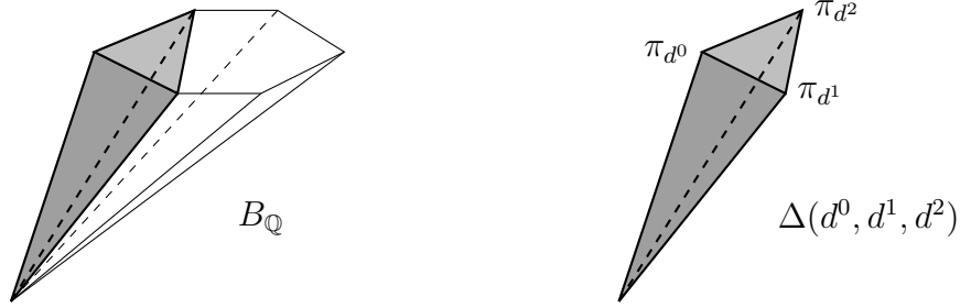
FIGURE 3. The cone B_{\mathbb{Q}} is a simplicial fan. The simplex corresponding to a maximal sequence d^0, d^1, d^2 is highlighted in gray. The extremal rays of a simplex correspond to pure diagrams.