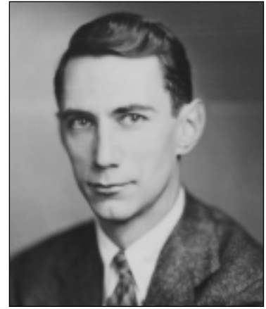
Claude Shannon, early years at MIT.