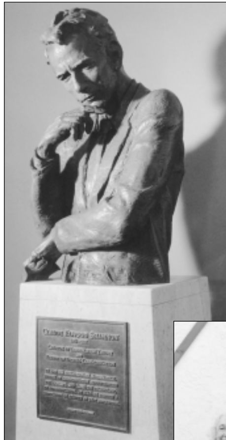
Left: Statue of Claude Shannon at the Laboratory for Information and Decision Systems (LIDS) at M.I.T.

Andrew J. Viterbi is professor emeritus at the University of California at San Diego and retired vice chairman of Qualcomm Incorporated. He is currently president of the Viterbi Group, LLC. His e-mail address is andrew.viterbi@viterbigroup.com .