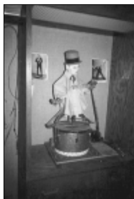
Shannon’s juggling machine, constructed sometime around 1983. Built mostly from pieces of an erector set and dressed to look like W. C. Fields, the machine bounce juggles three small metal balls in a cascade off a drum.