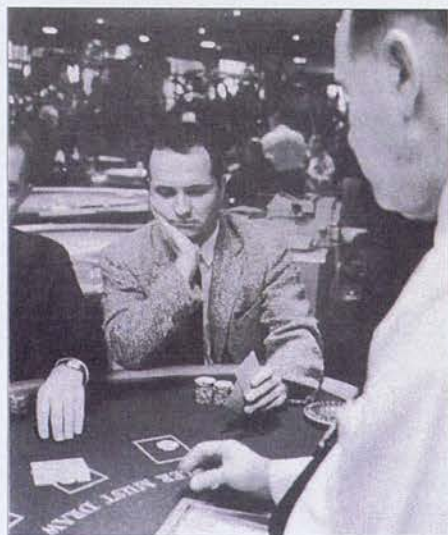
Mathematician and financial entrepreneur Ed Thorp wrote a bestseller, Beat the Dealer , about how to win at blackjack. His system, which involved a formula devised by John L. Kelly, was so successful that casinos had to ban him and change their rules for shuffling cards. Thorp is shown here at the Tropicana Hotel in Las Vegas in 1963. From Fortune's Formula .

Ed Thorp analyzed the game of blackjack far more deeply than anyone had ever done before, and he devised card-counting schemes to gain an edge, especially toward the end of a deck that